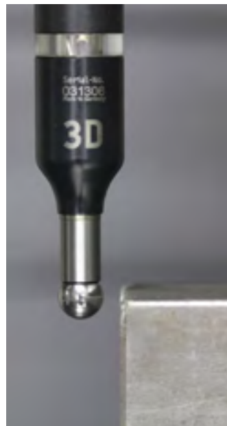
Probing Z axis